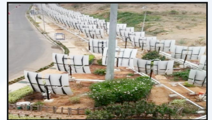
KOLAR HONDA BANGLORU (SANKALP ENERGY) PROJECT CAPACITY-100KW, COMMISSIONING DATE-MAR 2019