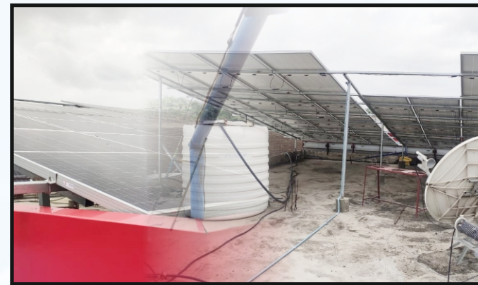
MANTRI PETROL PUMP, SEHORE EPC PROJECT CAPACITY-19KW, COMMISSIONING DATE-JUL 2020