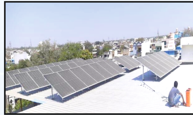
HOTEL NARAYAN PALACE, SEHORE PROJECT CAPACITY-20KW, COMMISSIONING DATE-JAN 2022