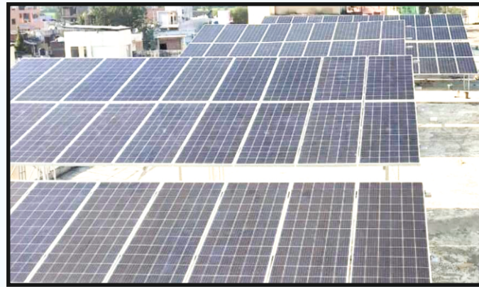
SATYAM MOTOR MARUTI SUZUKI, BHOPAL PROJECT CAPACITY-60KW, COMMISSIONING DATE-JUL 2020