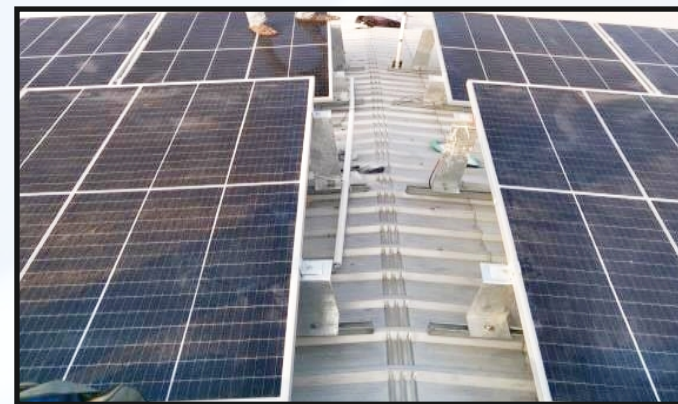
TATA MOTOR, SEHORE PROJECT CAPACITY-14KW, COMMISSIONING DATE-JAN 2022