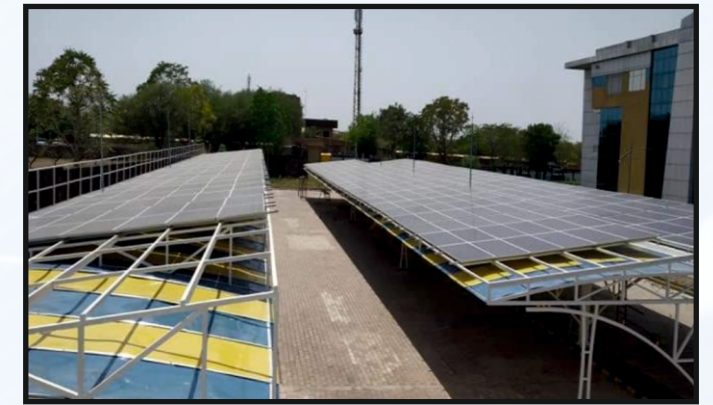
BORL BINA REFINARY, BINA PROJECT CAPACITY-140KW, COMMISSIONING DATE-MAY 2019