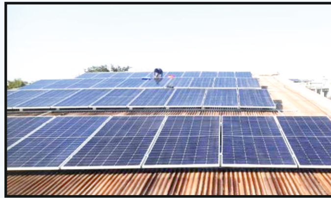
LEESA TAKIES, SEHORE PROJECT CAPACITY-20KW, COMMISSIONING DATE-JAN 2022