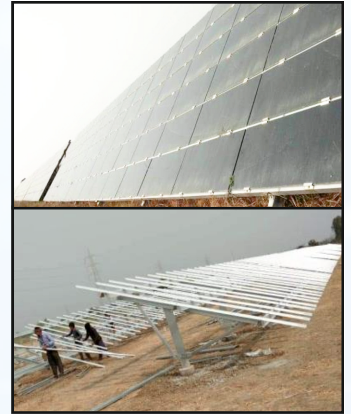
AZURE POWER, MAHOBA, GROUND MOUNT SOLAR PROJECT CAPACITY-2500KW, COMMISSIONING DATE-MAR 2019