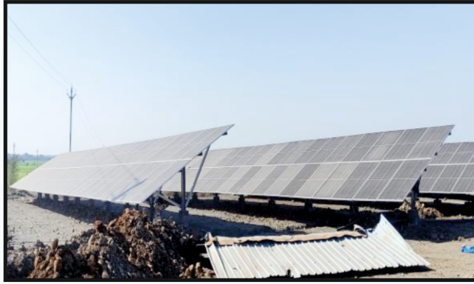
LATERI CRUSHER GROUND MOUNT PROJECT CAPACITY-150KW, COMMISSIONING DATE-FEB 2022

### Our major INC project are listed below ###