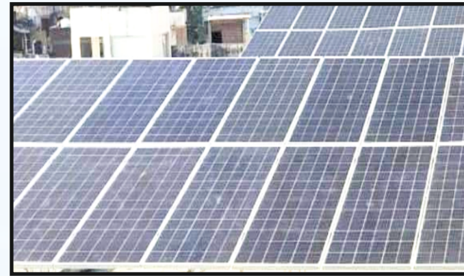
GLOBUS COLLAGE OF ENGINEERING, BHOPAL PROJECT CAPACITY-60KW, COMMISSIONING DATE-JUL 2020