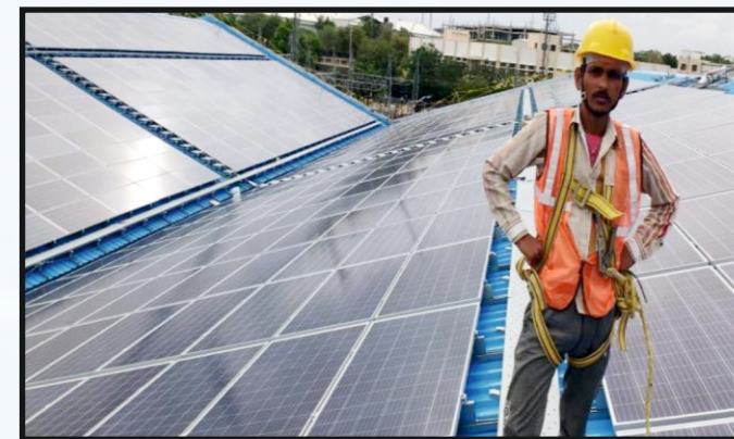
SPDL BARAMATI, MAHARASTRA PROJECT CAPACITY-400KW, COMMISSIONING DATE-JUN 2020