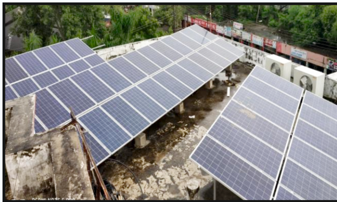
AIRTEL OFFICE, INDORE, M.P. PROJECT CAPACITY-30KW, COMMISSIONING DATE-JUN 2019