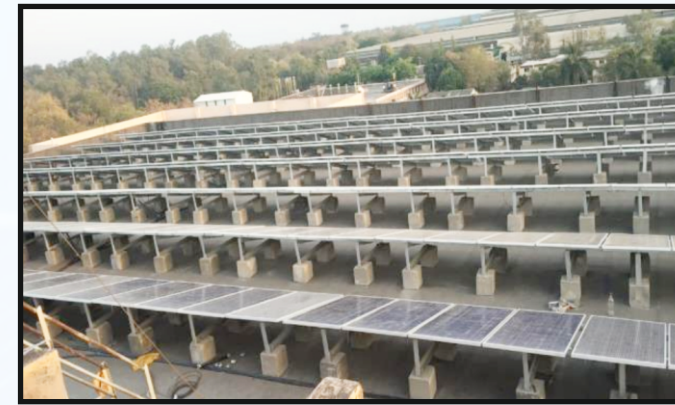
BHEL, BHOPAL PROJECT CAPACITY-310KW, COMMISSIONING DATE-JUL 2019