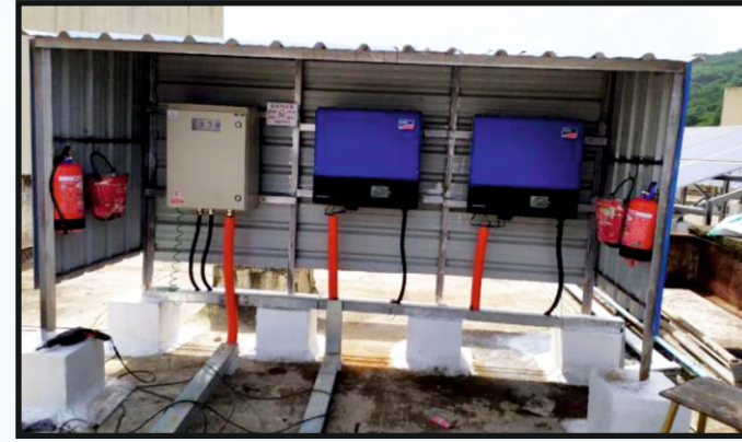
BHARTI VIDYAPITH KHARGAR MUMBAI PROJECT CAPACITY-80KW, COMMISSIONING DATE-APRIL 2019