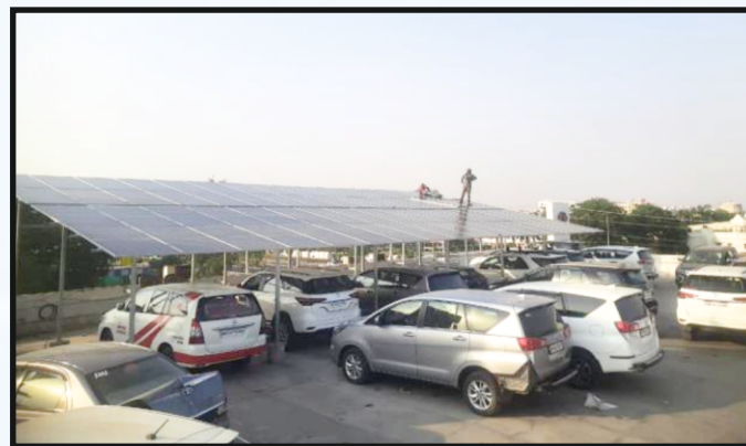
RAJPAL ABHIKAR TOYOTA, BHOPAL PROJECT CAPACITY-70KW, COMMISSIONING DATE-APR 2022